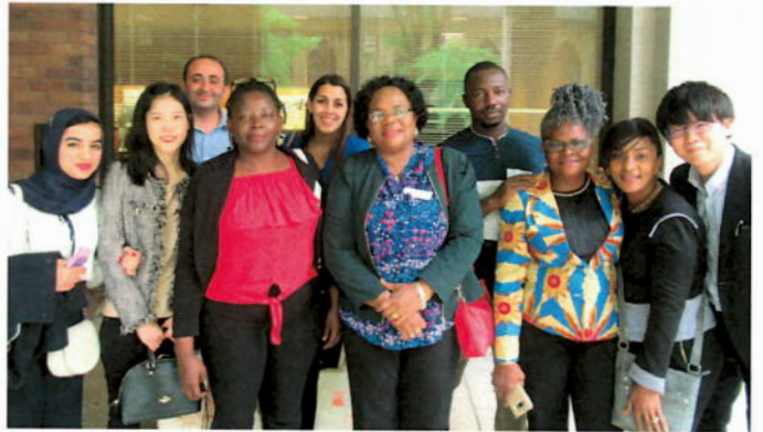
2018 Associates visiting the American Library Association (Chicago, June 2018)

library and information science to advance the mission of the Center. I was drawn to the position because the Center's mission allows me to work directly with librarians around the world to address their needs, develop leaders and dynamic user-centered libraries, and be engaged in working with them to address society's grand challenges and the United Nations 2030 Agenda for Sustainable Development. I was especially drawn to the possibility of advancing one element of the mission: "advance peace", that wasn't as prominent at the time of my hiring.