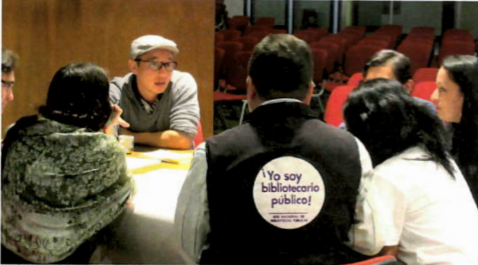
Co-developing CLIA in Bogota, Colombia; June 2017