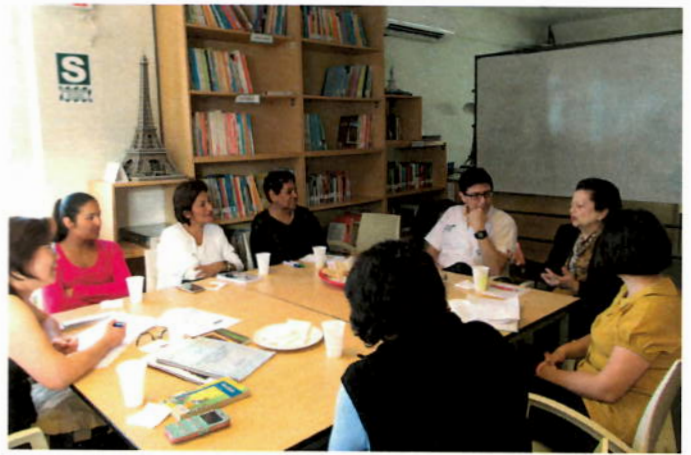
CLIA conversation with market vendors at Biblioteca Santa Cruz (Miraflores, Peru; November 2017)