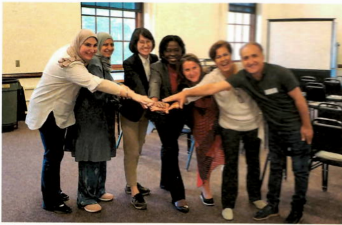
2019 Associates team spirit