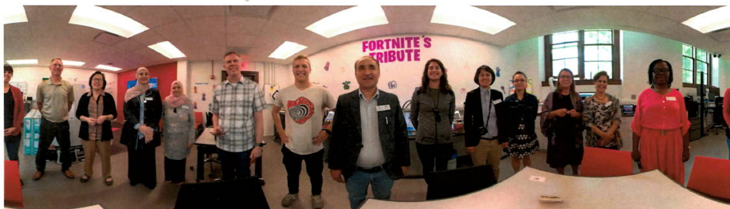
2019 Associates at TechHub (U. Illinois) - Serious and playful moments captured by 360 degree camera

Library Services (IMLS) Planning Grant, to understand the information needs and gaps in library services by learning from US and international librarians, international and national governmental agencies, and domestic resettlement and social services in order to develop recommendations and resources needed to support the resettlement and integration of refugees and asylum seekers in the United States. Given the international approach to this work and the number of resources available through our website, the most important takeaway from this project is that staff in any type of library and in any part of the world, should adopt the mindset that their library offers welcoming spaces and services to their communities, including the newest members of society, especially refugees and asylum seekers. When libraries embrace the value of being a welcoming place, then the appropriate knowledge and skills can be learned and much needed services provided.