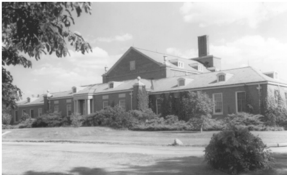
Archives Research Center

105 Horticulture Field Lab 1707 South Orchard Urbana, IL 61801